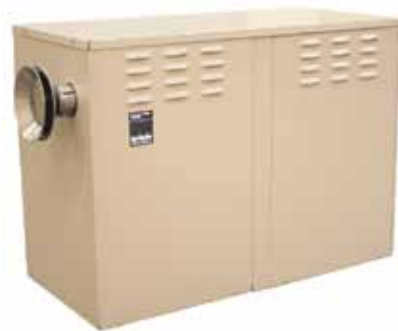
Brivis Compact PLUS CMX (External application)