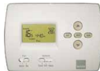
Suitable for Brivis ICE Add-on refrigerated cooling system with Brivis Classic heaters.

The Brivis Programmable Controller can operate in either auto or manual modes. In auto mode you preset temperatures and times for the heating/cooling system to turn on and off. Alternatively the manual mode allows you to turn the heating/cooling system on or off as desired.