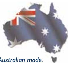
Australian owned, Australian made.

Our manufacturing operation employs hundreds of Australians and each Brivis system is made to withstand the extremes of the Australian climate. All Brivis products adhere to the strict ISO 9001 International Quality Systems standards, that's why our products have guarantees of up to 10 years (refer to page 11).