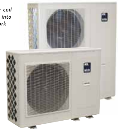
Brivis ICE Add-on refrigerated cooling system outdoor units