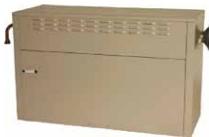
Brivis MX - Outdoor Unit

The technologies used in the Brivis StarPro series are a culmination of Brivis' 50 years of heating experience in Australia. The Brivis StarPro series features ensure that the heaters are more effective at heating your home, with the least amount of energy and expense. Every aspect of the Brivis StarPro series has been designed to make it more powerful, efficient, reliable, and unobtrusive.