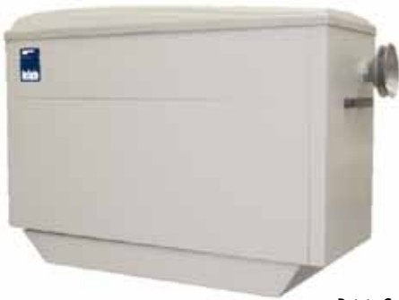
Brivis StarPro B-MAX*

If you are one of the thousands of Australians who have enjoyed the performance and reliability of one of Australia's highest selling ducted gas heaters, the Brivis Buffalo, you can now upgrade to the High Efficiency Brivis B-MAX simply, quickly and economically.