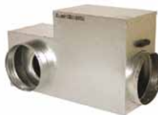
Brivis HX and MX - Indoor Unit

The Brivis StarPro series of heaters feature a spark ignition system to ignite the burners. A flame sensor on the end of the burners sends a signal to confirm that there is ignition across the entire burner. The gas ramps up to maximum to quickly heat up the heat exchanger, the circulation fan starts slowly, and gently ramps to the optimum speed for heating the house. This ensures that the start up of the heater is extremely quiet, delivers heat in the fastest possible time and that you don't feel a cold draught when the fan starts.