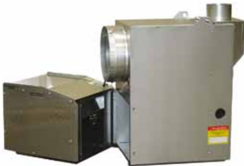
The Internal Brivis Two Piece Wombat for easier installation.

The Brivis Buffalo Series heaters are perfectly designed to be installed unobtrusively outside your home.