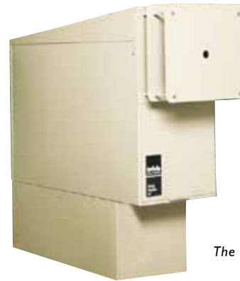
The external Brivis Buffalo.

Our Brivis Upflow and Downflow heaters are designed to be installed in a cupboard or under the stairs. Ideally suited for townhouses, apartments and other homes with vertical airflow installation requirements.