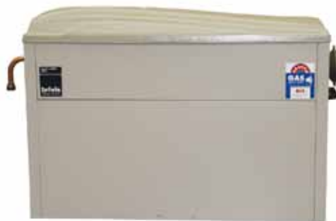
Brivis HX - Outdoor Unit

The Brivis StarPro PLUS medium efficiency range employs all of the great features and benefits of the Brivis StarPro MAX range, but at a medium efficiency star rating. The Brivis StarPro PLUS series has an efficiency range from 4.2 stars to 4.4 stars.