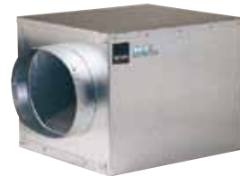
The Brivis ICE Add-on refrigerated cooling system series indoor coil unit is incorporated into your heating ductwork

Brivis ICE Add-on refrigerated cooling system comes with a full five year warranty on parts and labour.